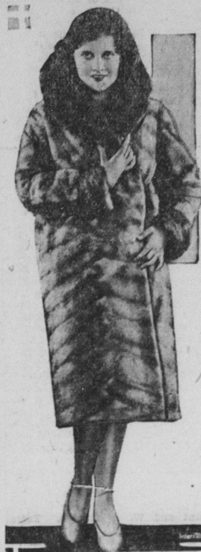
Silver muskrat is one of the favorite furs used for winter coats that will be in evidence again this season. The model was posed by a prominent motion picture player.