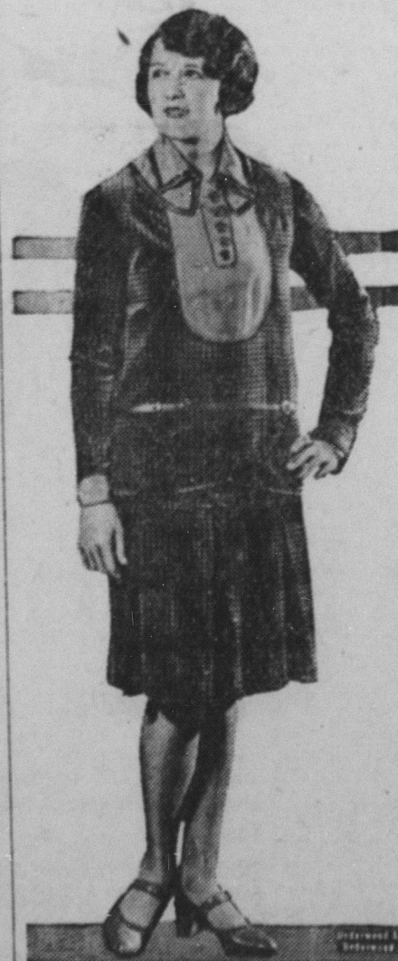
One of the newest and prettiest of the gowns for fall and winter wear is carried out in plaid velvet, with collar, cuffs and plastron effect of solid color. The strap belt and the rounded line at the waist afford a novel effect that is very striking.