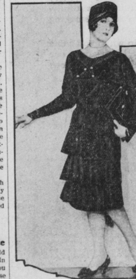
Short-Waisted Silhouette Worn by Motion Picture Actress.

The short-waisted silhouette, which can be worn smartly by only a very few, is charmingly illustrated in the frock worn by Gertrude Olmsted, the motion picture actress, in "Becky," her