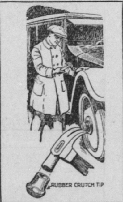
Rubber Tip on Hammer Head.

It is impossible to hammer on a polished wooden or metal surface without making dents. An ordinary hammer will never do the work unless the head has been padded in a suit-