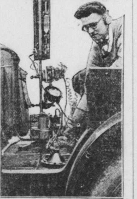
Testing Comfort of Auto.