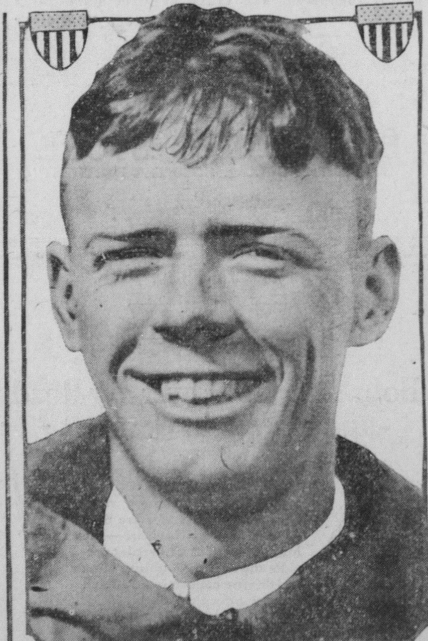
Photograph of Capt. Charles Lindbergh, hero of the nonstop flight to Paris, with the boyish smile that wreathed his face at the completion of his great feat.