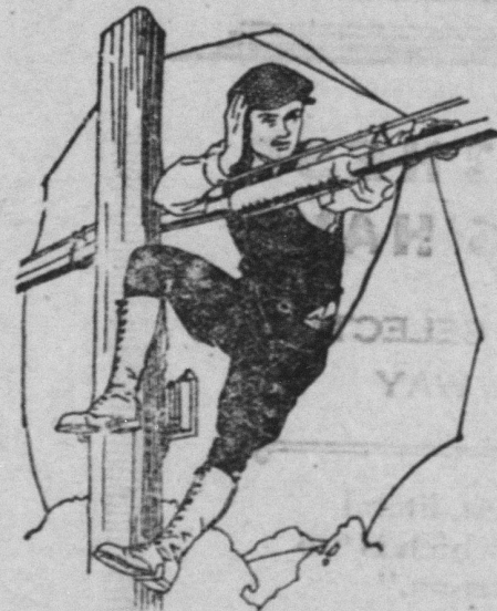
Testing Aerial Cable