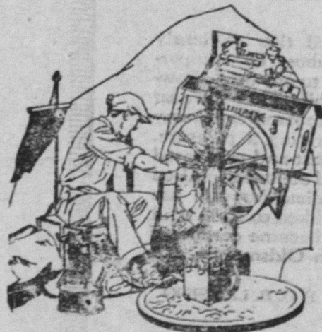
Working on Underground Cable