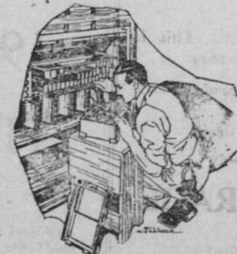
Testing in a Central Office