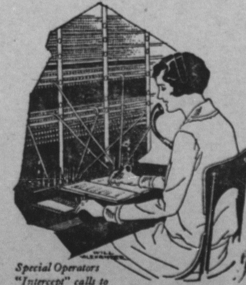
Special Operators "Intercept" calls to numbers which have been changed