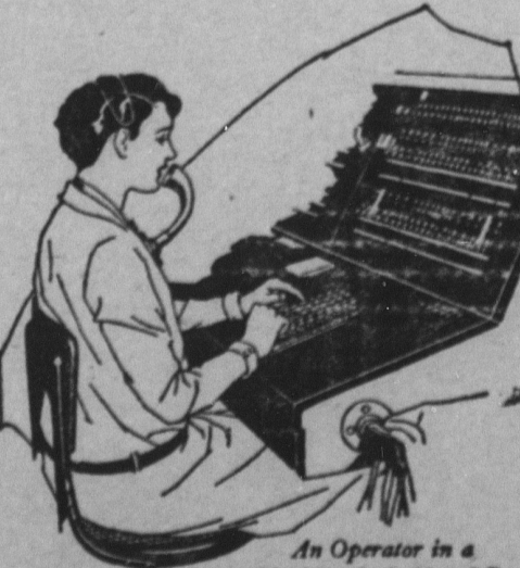
An Operator in a Machine Switching Office