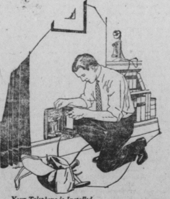
Your Telephone is Installed Where It Suits You Best