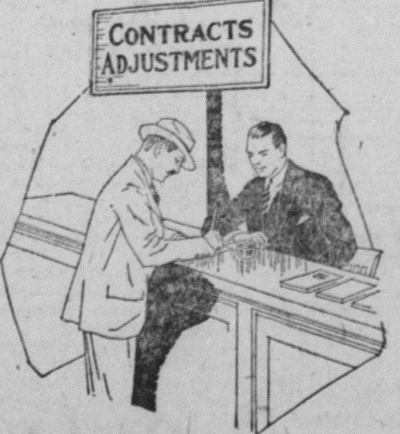
Personal Service Begins When You Order Your Telephone