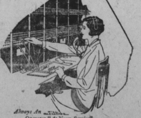
Always An Operator "At Your Service"