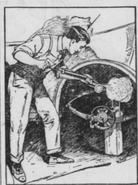
Using a Spray Pump for Painting Springs and Other Parts.

Usually a good brush is used for painting the body and fenders of a car, as these surfaces are smooth and can be thoroughly cleaned before applying the paint. However, it is quite a difficult matter to clean the springs and other parts under the car and by painting them with a brush one always picks up dirt out of the cracks and corners, which covers the brush and spoils the painted surface. By doing the painting with a spray pump,