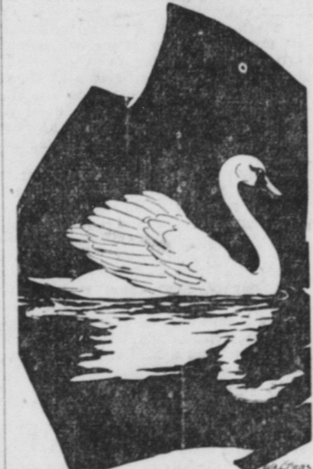
"I Am Very Tame," Said the Trumpeter Swan.

"OF COURSE," said the Trumpeter Swan, "my voice is interesting. Though I am in the zoo now I cannot say that I have traveled very far in order to reach this spot. "Of course I belong to a very, very old family. Trumpeter Swans have been in existence for years and years and years and years and even then a few more years! "I am very tame because I was brought here when I was young, and if one is brought up among people when one is young, then one is not afraid. "Of course, that is provided the people are good to you. They were