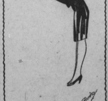
"It is to be noted," says Pertinent Polly, "that having a sharp tongue never gets anybody a reputation as a cutup."