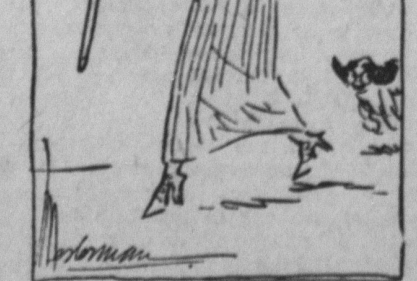
The young lady across the way says no wonder lamb is so expensive when so many of the sheep are killed just for their wool.