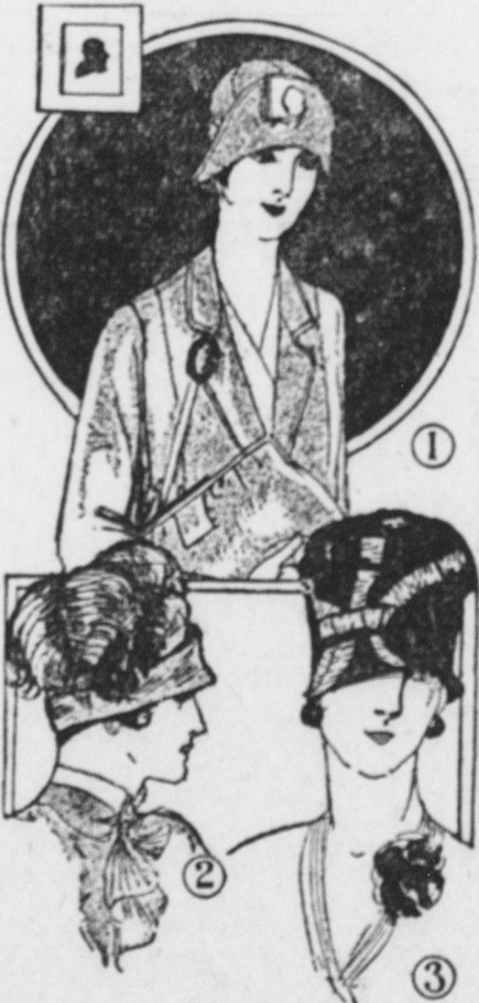
1—Hat, Jacket, Purse and Parasol All Developed in Marron Velvet. 2—Hat of Rose-Colored Velvet With Flat Ostrich Tips in Two Tones of Rose. 3—High Draped Hat With Tiny Poke Brim, in Black Velvet.

haute monde were once more going to cold-shoulder elaborate millinery in to the limbo of the demodee.