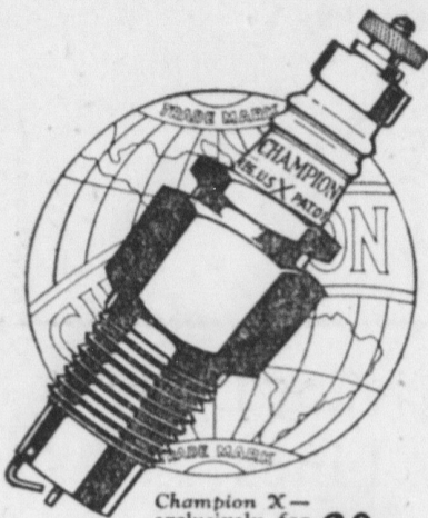
Champion X—exclusively for Fords—packed in the Red Box 60c Each

The greatest thing about a Ford is the way it keeps going, even under the worst conditions. The dependability of Champion Spark Plugs—which have been standard Ford equipment for 14 years—is an integral part of Ford dependability.