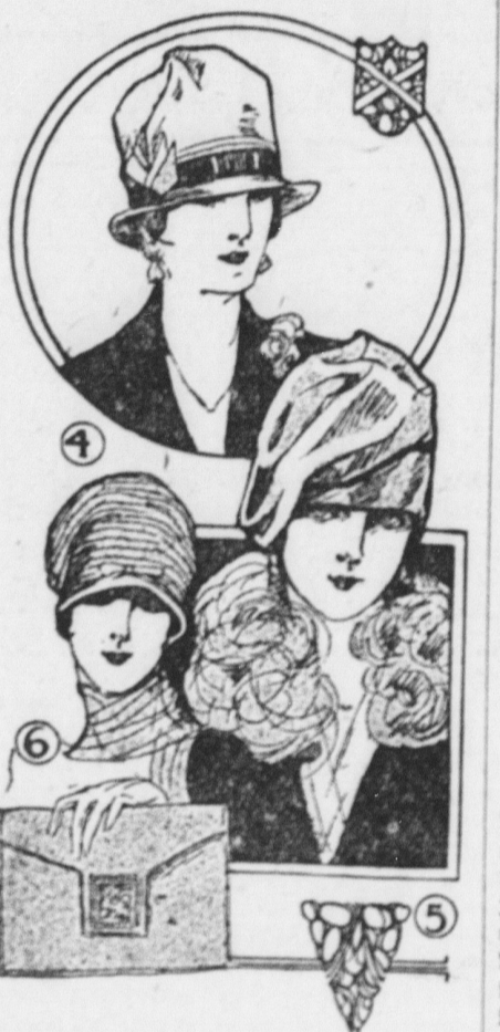
4—Fawn-Colored Felt, of Grosgrain Ribbon. 5—Tam With Earmuff Effect. Velvet. 6—Tam, Two Tones of Lilac Velvet Rolled into Tiny Strips and Joined Together in Circular Fashion.

Velvet and felt are favored hat fabrics of autumn, and they are far in advance of all others. Velvet is an excellent material with which to achieve decorous effects. Felt is often used in combination with contrasted fabrics—as often it is used alone, but in several different tints