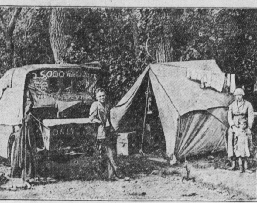
Tent and Cooking Kit Are Important for Camping Out.

Camping out is one of the great privileges available to all who motor and at this season thousands of motor car owners are planning their expedition.