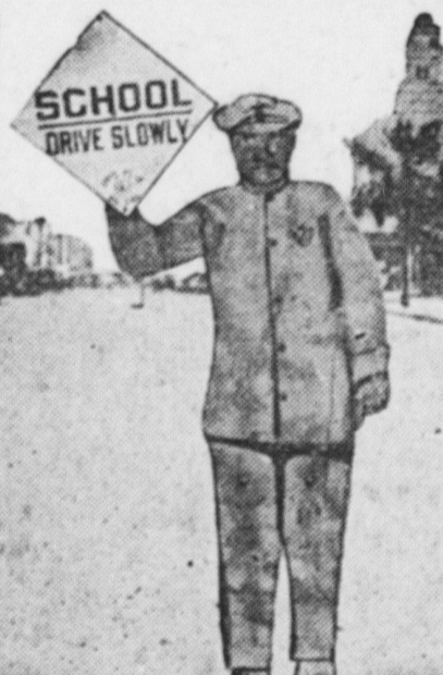
Protection Against Motorists.

To insure motorists observing the sign, "School Street" "Slow Down," in front of their schoolhouse, boys of