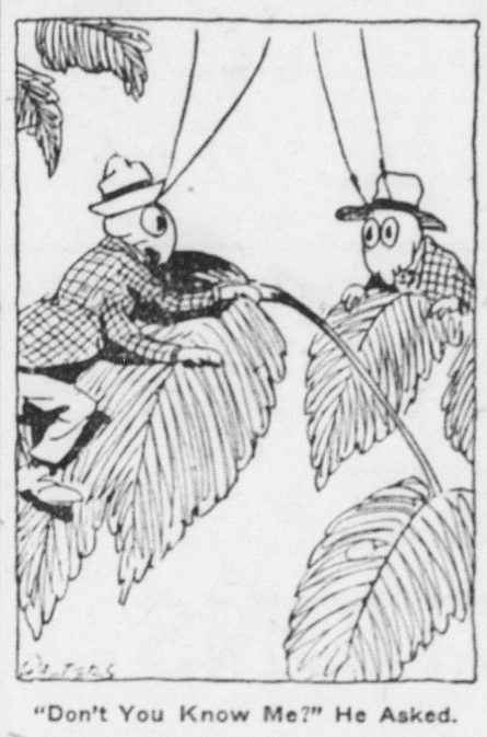
"Don't You Know Me?" He Asked.

IN SPITE of his lengthened horns. Leaper the Locust hardly dared show himself while his cousins remained in the neighborhood.