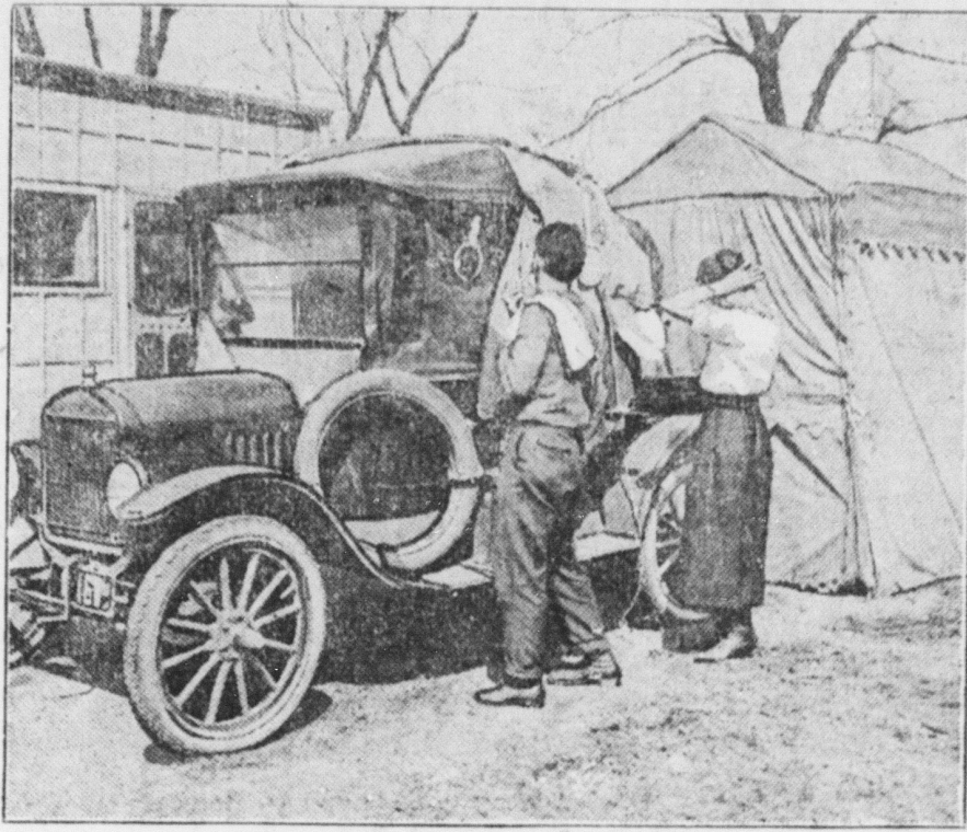
The Morning Toilet in "Tin Can Camp."

The question, "What shall we eat, and what shall we wear, on our camping trip?" is answered in a bulletin issued by the touring bureau of the Chicago Motor club.