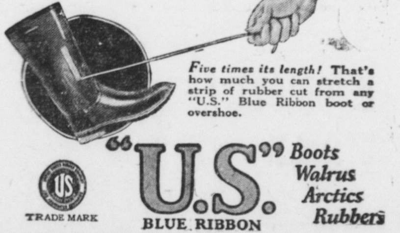
Five times its length! That's how much you can stretch a strip of rubber cut from any "U.S." Blue Ribbon boot or overshoe.