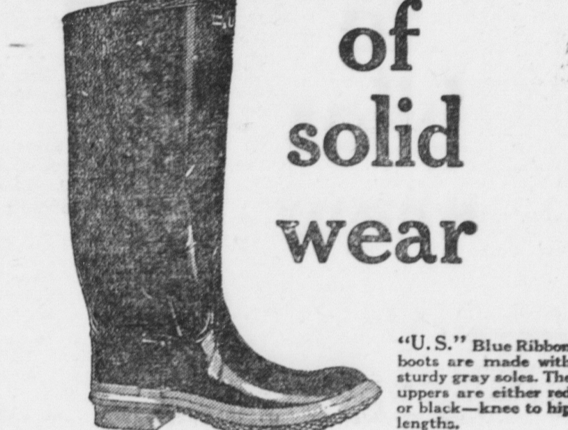
"U.S." Blue Ribbon boots are made with sturdy gray soles. The uppers are either red or black—knee to hip lengths.

These new "U. S." Blue Ribbon boots and overshoes are built to give longest wear.