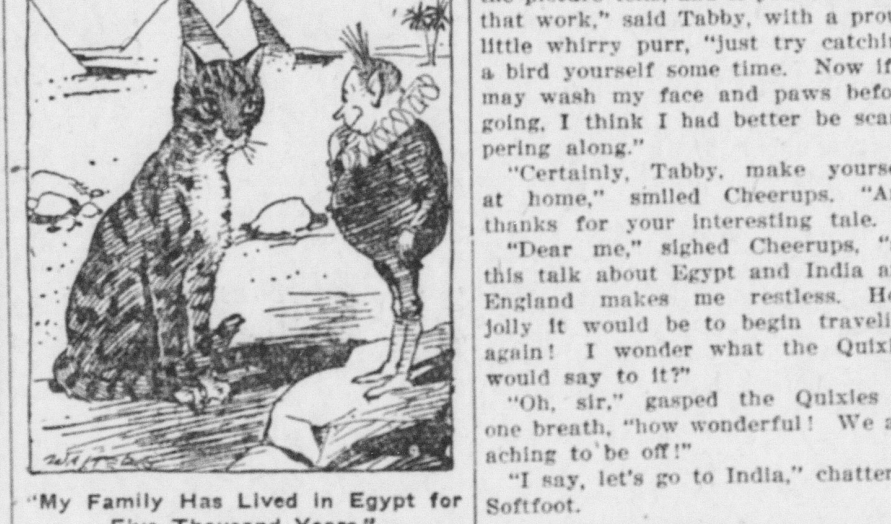
"My Family Has Lived in Egypt for Five Thousand Years."

"Please do," cried the astonished Cheerups, as he looked curiously at his visitor. She was a little larger than one of our North American cats, of a grayish-yellow color with a few dark stripes on her back, and her fine tail was ringed about and tipped with black. "Well," continued Puss, "it's very probable that the ancestor of all the pet cats in the world was like me,