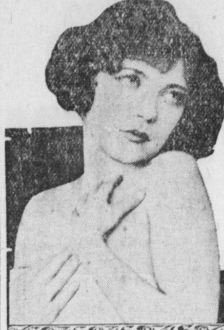
Miss Adoree, the "movie" star, is one of the screen's most beautiful and talented actresses. She is well known in this country as a capable actress and is famed abroad for her interpretative dancing.

"Japan would be nice," murmured Sniffsniff. "China is better," coaxed Quickear. "I think Australia would be more exciting, because we don't know much about it," piped Brighteyes. "Brighteyes is right; we'll go to Australia!" cried Cheerups, "and let's go now!" With that he jumped on a flying leaf and soared away over the still green jungle. Shouting with glee, each of the frisky little Quixies snatched a convenient breeze and followed. "Isn't this fun?" called Cheerups merrily. "We shall certainly broaden our acquaintance, and perhaps there will be folks in Australia who need help too!" (© by Little, Brown & Co.)