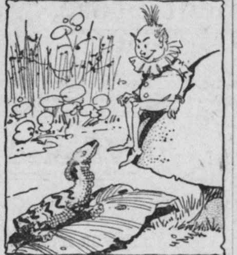
"Of Course You Don't Know Me." the Little Creature Said.

"No, of course you don't know me." cried this little creature. "I am Lizzle Lizard and they call me a Gecko be-