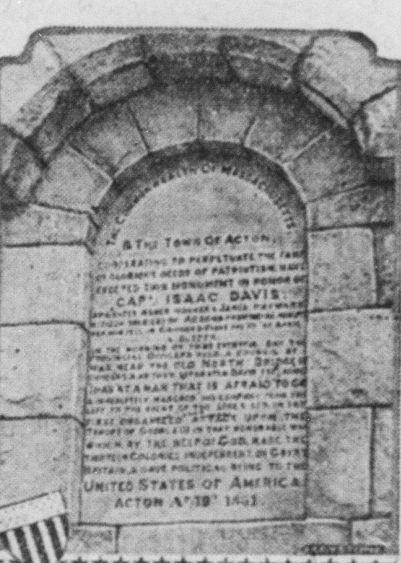
At Acton, Mass., is this monument, erected to Capt. Isaac Davis, who commanded the troops of Acton in the battle of Concord Bridge. Captain Davis was the first man killed.