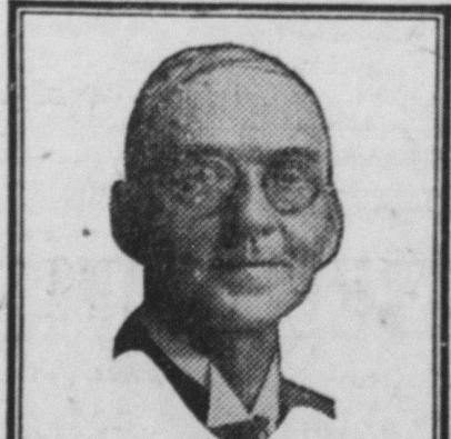
Baptist Minister Praises TANLAC

"I had suffered from stomach trouble and nerve troubles for over 30 years until I could hardly summon the strength necessary to prepare my sermons. Six weeks after taking Tanlac I had a brand new outlook on life. I had a fine appetite, steady nerves and a brand new digestive system. Tanlac has never failed me."