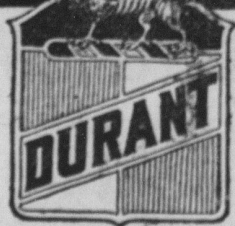
Just a Real Good Car

STEADY, RESPONSIVE POWER, flexible to every need and control, comes from this sturdy engine. Try to pass a DURANT on a hill: Yet driving a DURANT is a keen pleasure because it's so easy. Won't you try it? We'll be glad to arrange it.