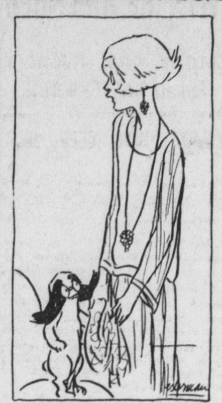
The young lady across the way says she's old-fashioned enough to think that girls look better in skirts than in anything of a bipartisan nature.

(Copyright by the McNaught Syndicate, Inc.)