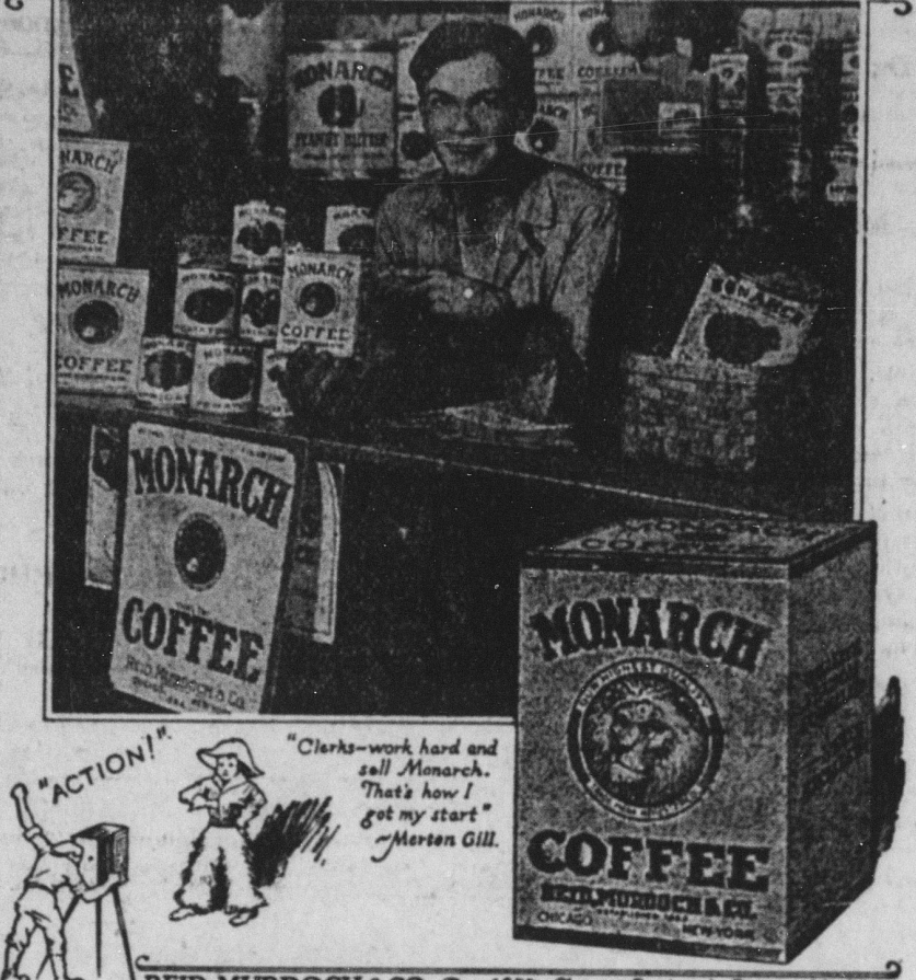
REID, MURDOCH & CO., Est. 1853. Chicago, Pittsburgh, Boston, New York