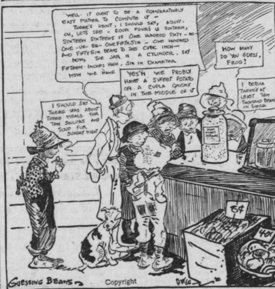
GUESSING BEANS Copyright DWG