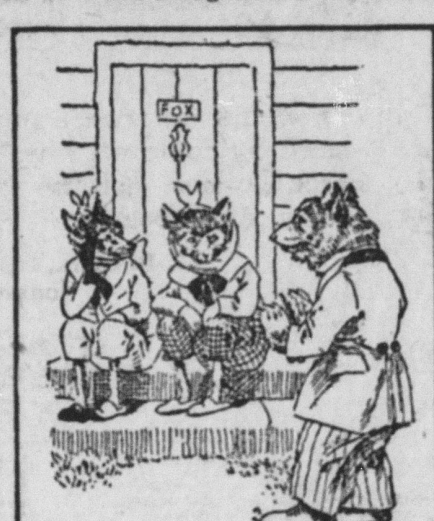
"What is the Matter, Sonnies?" inquired Mr. Bear.

MR. BEAR had a dreadful time trying to catch the one who stole his berry pies. For Mr. Bear was a good cook and especially fond of berry pie, and when the berry season came he always feasted. One day he made five big pies and placed them in the window to cool, but he was very fond of his noonday nap, and when he awoke he found all of his berry pies were gone. Mr. Bear was a good-natured fellow, but he was angry now. He scratched his head and thought hard. "I wonder