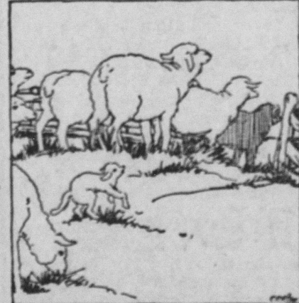
They All Followed Sheepy.

to get up and see just what it is or what we can do with it. "We take life very easy." "That is why they say people can put themselves to sleep by thinking of us as we go through a gate, one after the other." "There is something restful and peaceful about us." "There is certainly nothing exciting about us," said Mrs. Sheep. "But people love us and we have many friends and we are happy and contented in our own gentle fashion." "Why should we go dashing about when we don't care about it? No reason at all." "Baa-a-a, baa-a-a, baa-a-a, baa-a-a," said the other Sheep. "No reason at all." "Let us lie in the meadow and be happy. Let us take a nap, nappy. Or let us stay wide awake. And think what a picture we make As we sit in the meadow, baa-a-a. And now we must bid you 'ta-ta.'"