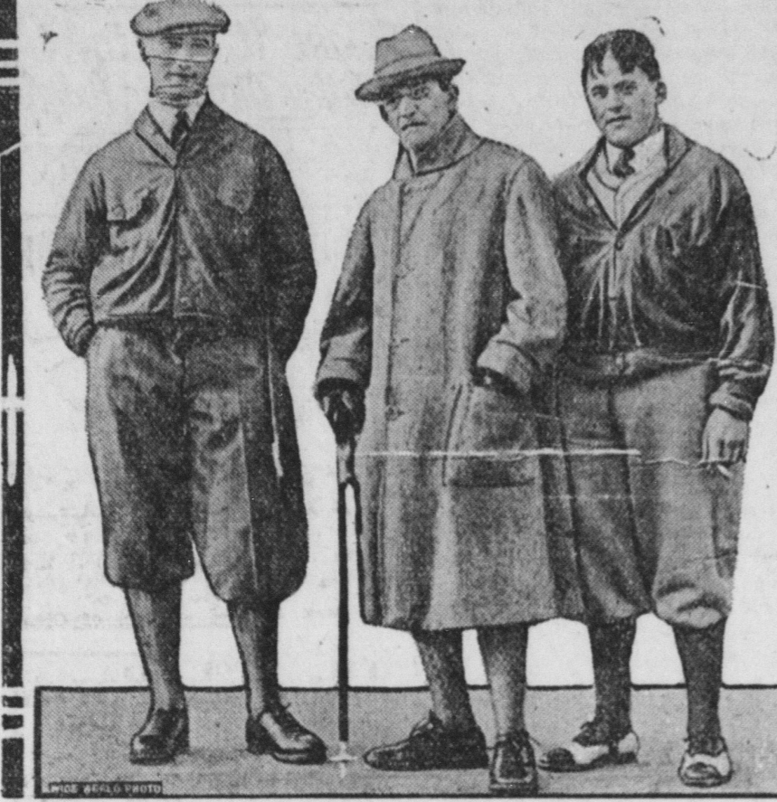
Arthur Havers, British open golf champion; Walter J. Travis, the only American who ever won the British amateur championship, and Bob Jones of Atlanta, American open champion, photographed at Augusta, Ga.