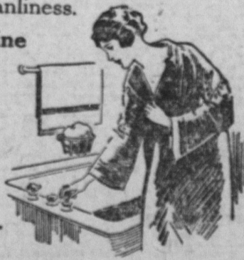
Cleanliness Demands More Than Baths

Don't give disease a start. Adopt this habit of internal cleanliness. Nujol is not a medicine. Like pure water, it is harmless. Take Nujol as regularly as you brush your teeth or wash your face. For sale by all druggists.