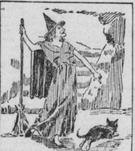
"A Little Black Kitten You Shall Be."

ONCE upon a time there was a wicked witch who lived in a cave in the forest because she did not like anyone and wanted to be all by herself. She did not like the birds, she disliked the animals, and if anything or anybody ventured near her cave she promptly changed them into stones.