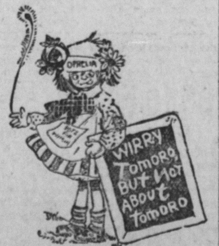
(Copyright, by McClure Syndicate.)

FACTS about your name; its history; meaning; whence it was derived; significance; your lucky day and lucky jewel