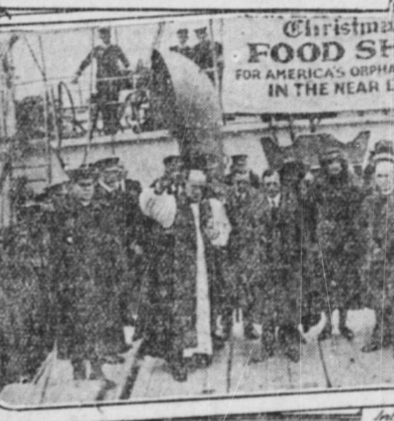
Christmas FOOD SHIP FOR AMERICA'S ORPHAN WARDS IN THE NEAR EAST

parliament December 24, 1652, for seven years—but they practically ignored Christmas and made Thanksgiving their day of rejoicing.