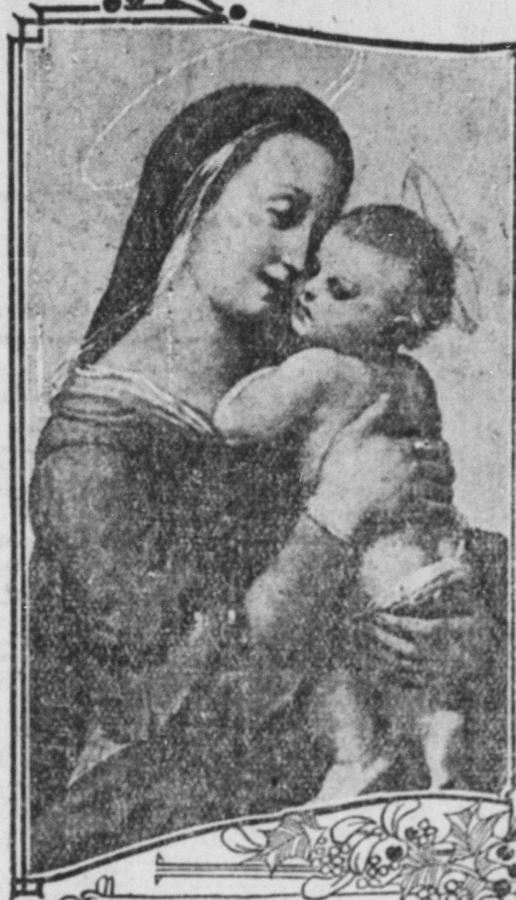
Madonna Di Terzoi from Paintings by Raphael