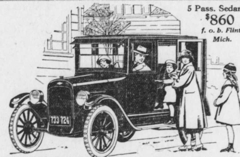
5 Pass. Sedan $860 f. o. b. Flint, Mich.

Many a true word has been spoken regardless of grammar.