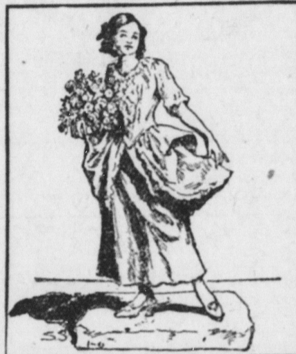
China Lady Stood on the Shelf.

IN THE toy shop a beautiful china lady stood on the shelf. In one arm she carried a bouquet of many-colored flowers and with the hand of her other arm she daintily held her prettily trimmed skirts ready to make a curtsy. China lady did not look so very proud, but she was, for never once did she deign to glance below her at the toys on the floor. Her pretty blue eyes were looking straight ahead and all the floor toys felt she would never look down to notice them. None of them cared very much about this haughty lady's disdainful air but little French Doll, her pretty dark eyes flashed as she said to Teddy Bear and small Rocking Horse, "She need not feel herself so much above