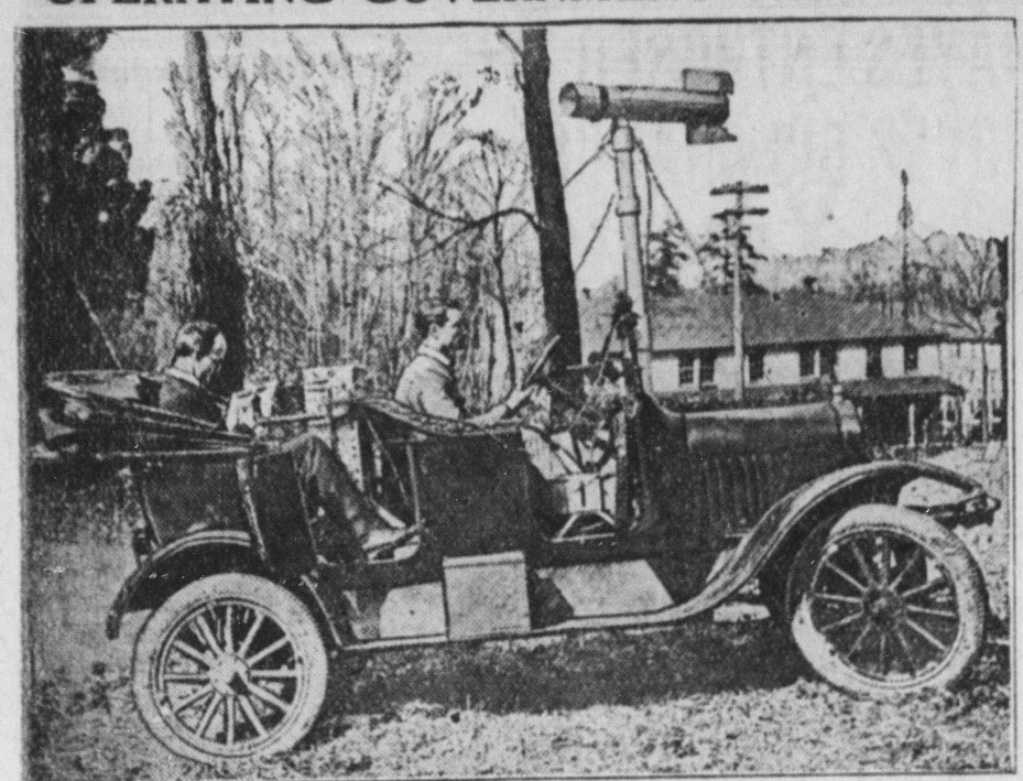
W. S. James and C. S. Bruce of the automobile power plant of the insean of standards, driving the test car used to determine the power output of the engine, combustion valve of the fuel, wind resistance, etc. This car is wise used in experiments to discover gasoline substitutes and is fitted with a gramera which automatically records the fuel consumption.