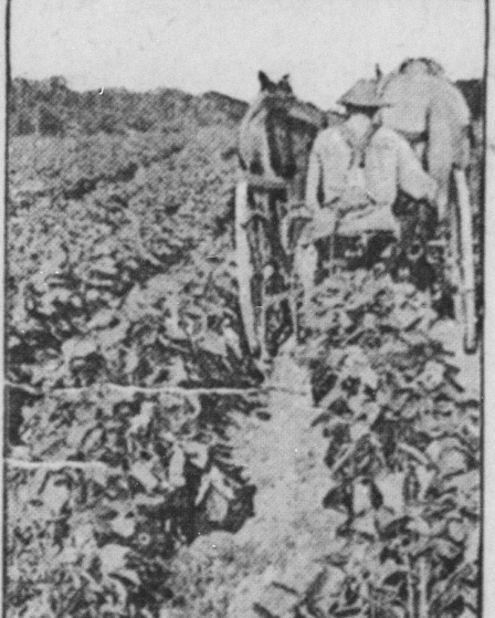
Cultivating a Field of Soy Beans.

Fertilizer Not Profitable . The application of fertilizer to the soy bean crop on either fertile or highly fertile land usually is not profitable.