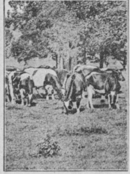
Legume Hays Contain the Most Needed Supply of Lime.

Lime and phosphorus, although they are found in relatively small quantities in feeds, have a great deal to do with milk production and building up the body of the unborn calf. If the cow does not have enough of these elements in her ration she will draw on the supply in her body for a time, and heavy producers commonly do this. Therefore, says the United States Department of Agriculture, it is a good practice to feed cows well when they are running low in milk yield and when they are dry, so that they may store up these elements as well as others in their bodies for use when the large demand is made. Must Have Reserve Supply. The common view is that dry cows need only enough feed for maintenance, but experiments carried on by the department show that this is not true. The cow is a milk-manufacturing plant, and, like many factories, she must have a reserve supply of materials to draw on when heavy demands are made. A cow that has been well fed when dry and has stored up this reserve is able to produce more on full feed than a cow that has been given only a maintenance ration during that resting period. In this way a cow can utilize her capacity the year round, although she may not be giving milk all the time. In keeping up the necessary lime and phosphorus supply it is well to keep in mind the fact that certain feeds are richer than others in these