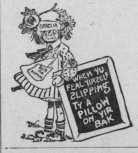
When you feel yourself slipping, try a pillow on your back.

"I had to turn around, for they were right in my path. The dogs came after me, of course, and I ran under the barnyard gate. They couldn't get