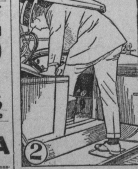
Completing the Entrance.

the average person when about to get into a machine proceeds to put the right hand, if entering from the curb side, well out on the door and to bear upon this hand and arm. Doors were made to enter and leave through, not to carry the weight of a person. They are supported to the side of the body by comparatively frail hinges secured to an upright post that forms one of the body supports. Once a door is sprung it is well-nigh impossible to repair it so that it will again assume its normal position as part of the body, fit snug and not rattle. The reason is because not only is the door itself sprung out of shape, but the body post