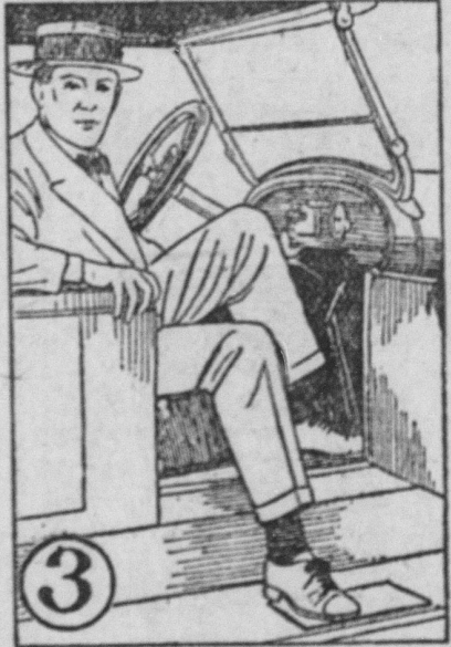
Getting Out of a Car.

is simple enough if one will but put the right foot on the running board, grasping the body of the car, one hand on each side of the door, and