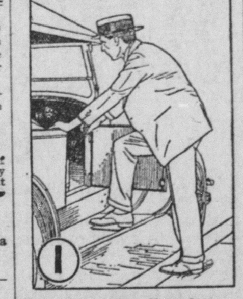
Getting into a Motor Car.

Doors Were Made to Enter and Leave Through and Not Bear Weight of Person—Hinges Are Made Comparatively Frail. Getting in or out of an automobile is an awkward job for most people. They do not seem to realize that with but a moment's forethought that it can be made a very simple proposition, says Washington Post. To begin with