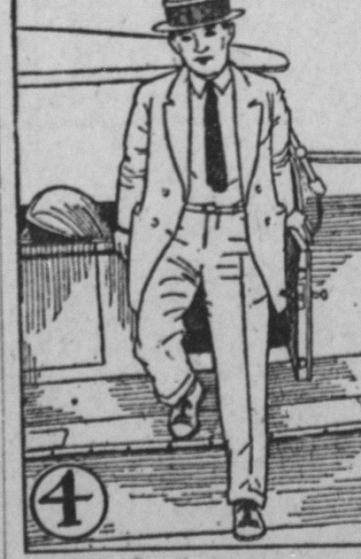
Exit From Car Completed.

In getting out of a machine if one will but grasp the side of the body with the right hand, at the same time placing the right foot on the running board, as shown in the third illustration,