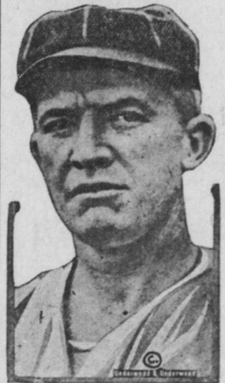
Grover Cleveland Alexander.

Grover Alexander of the Cubs is one of the real veterans of the National league. He is nearing his goal as a pitcher, but that is not interfering in any way with his being one of the stars of the game today despite the fact that it is considered harder to pitch consistently than it was years ago. There are two reasons for this: