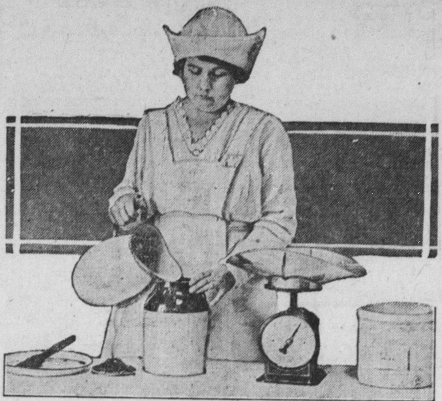
Pouring the Brine on the Pickles.

(Prepared by the United States Department of Agriculture.)