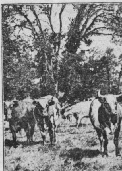
A Man May Feel Independent if He Possesses a Nice Bunch of Cattle.

(Prepared by the United States Department of Agriculture.) Plans for a nation-wide live stock reporting service showing the monthly changes in the live stock situation on farms are now being made by the United States Department of Agriculture, under the $70,000 congressional appropriation recently made for this work. The service will also include the forecasting and reporting of the important live stock movements. Make-Up of Reports. At recent conferences of statisticians and crop and live stock estimating ex-