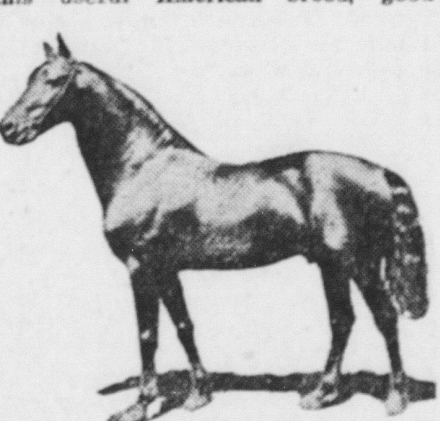
This Is the Type Being Used to Breed Army Remounts.

As a result of the efforts of the United States Department of Agriculture in improving the Morgan and in stimulating a renewal of interest in this useful American breed, good