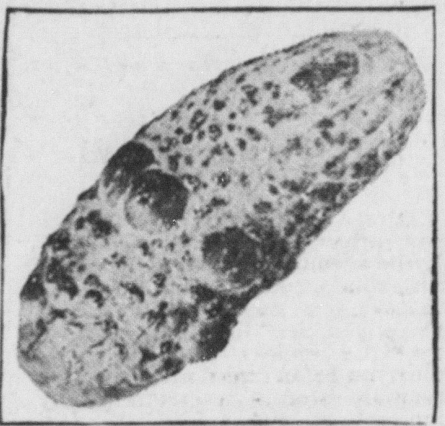
Mosaic Disease of Cucumber.

Wild Cucumber Vine and Common Milkweed Are Principal Host Plants of Malady—Eradication Is Strongly Urged.