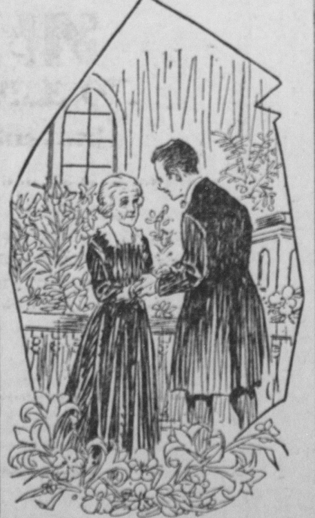
"I Cannot Tell You How Much You Have Helped Me."