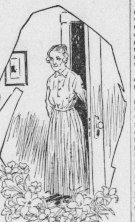
"Did You Wish to See Me?"