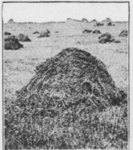
Curing Sweet Clover Hay in Cock.

Sweet clover is one of the best pasture plants known. If pastured heavily enough it will keep green and growing all through the summer when most grass pasture dries up. It must