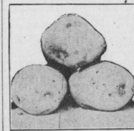
Healthy Irish Cobbler Potatoes.

The potato acreage in certain irrigated sections of the West has been increased this year by one-third as compared with that of the last year, yet the yield in these districts is only two-thirds of normal. Many growers complain that where 900 sacks or more were raised to the acre in former years, only 100 to 150 sacks are obtainable now. This is in fields under good cultural conditions, showing good stands and a high freedom from fungus and bacterial diseases. The low yielding quality of the strains in question no doubt is principally a manifestation of mosaic. The need of good seed in the West is well recognized and is growing every year, yet only a meager quantity of even relatively good seed is obtainable.