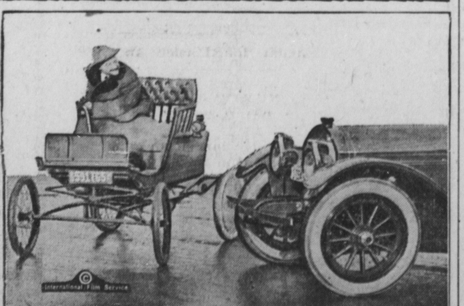
Maney Oldfield is shown in the photograph driving an 1899 model steam-driven machine. It beat an equally aged gas car in a race for the honor of leading the parade opening the auto show at the Coliseum in Chicago recently.