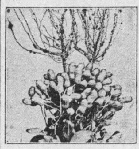
A Good Peanut Plant.

Peanuts are a drug on the market just now. That's because they are not eaten largely in cold weather, but with the coming of the robin, which is a harbinger of spring, circuses and the opening of summer resorts, peanut shippers look for increased consumption, which may mean higher prices. In round figures, 900,000,000 pounds of peanuts are grown in the United States every year and 100,000,000 pounds were imported from Asia last year. About 5,000,000 pounds of roasted peanuts are consumed annually, say