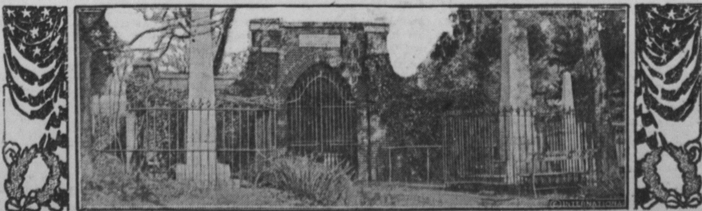
TOMB OF WASHINGTON, AMERICA'S NATIONAL SHRINE

"Inspiring auspices, this day, surround us and cheer us. It is the anniversary of the birth of Washington. We should know this, even if we had lost our calendars, for we should be reminded of it by the shouts of joy and gladness. The whole atmosphere is redolent of his name; hills and forests, rocks and rivers, echo and re-echo his praises." "All the good, whether learned or unlearned, high or low, rich or poor, feel, this day, that there is one treasure common to them all, and that is the fame and character of Washington. They recount his deeds, ponder over his principles and teachings, and resolve to be more and more guided by them in the future."