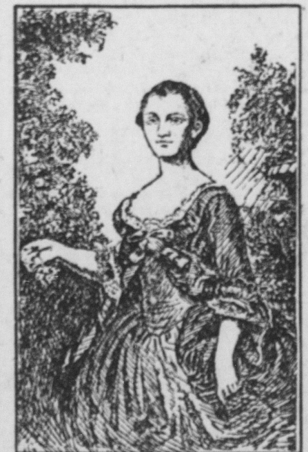
Martha Washington as She Appeared in 1790. (From an Old Engraving.)