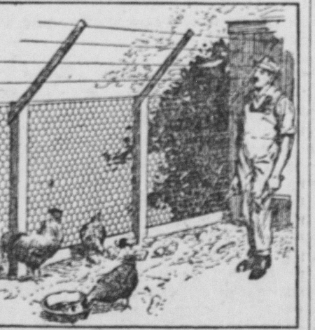
Wires Stretched as Shown Here Will Effectively Prevent Chickens From Wandering Into the Neighbors' Yard.

Chickens can be kept in their pen by nailing two-foot slats at an angle to the posts and strating a number of strands of thin wire through them as shown in the drawing. The chickens do not see these wires and when