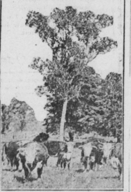
A High-Class Beef Breeding Herd.

(Prepared by the United States Department of Agriculture.) We are a nation of meat eaters. The average American eats more than 140 pounds of this concentrated food each year. The importance of meat, particularly beef, is nowhere more emphatically brought out than at the great central stockyards, some of which cover nearly a square mile of ground. To keep the supply of animals moving through these yards, necessary to feed the millions of people, requires the raising of cattle, hogs, and sheep on hundreds of thousands of farms and ranches. Improve Each Generation. In profitable beef production a herd of good cows and a good purebred bull are of great importance. Each