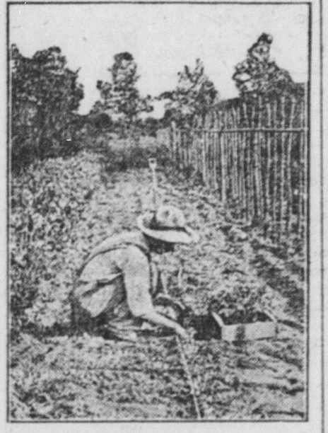
Setting Out Plants Started in Hotbed.

In planning the garden it should be borne in mind that certain crops, such as lettuce, radishes, and early beets, can frequently be grown in the same rows with other crops and be removed before the main crop attains sufficient size to require the entire space.