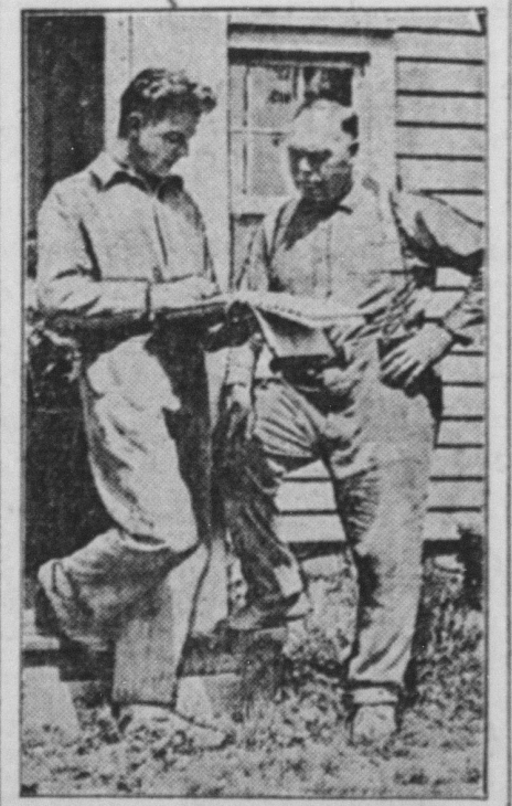
The County Agent Explains the Simplicity of Making a Farm Inventory.

must be estimated and appraised. The financial property has a face value, which under any conditions ordinarily met with on the farm needs no appraisal. The physical property may be grouped under the following heads: Land, buildings, other permanent improvements, work stock, cattle, swine, sheep, poultry, machinery and tools, farm produce, farm supplies, growing crops. The financial items include cash on hand, cash in bank, accounts receivable, and notes receivable. By receivable is meant debts owing to the farm.