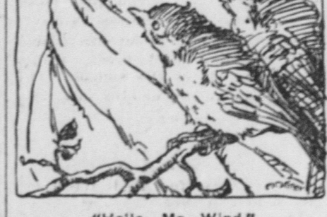
"Hello, Mr. Wind."

"Then, too, we sing because we want to let people know that money