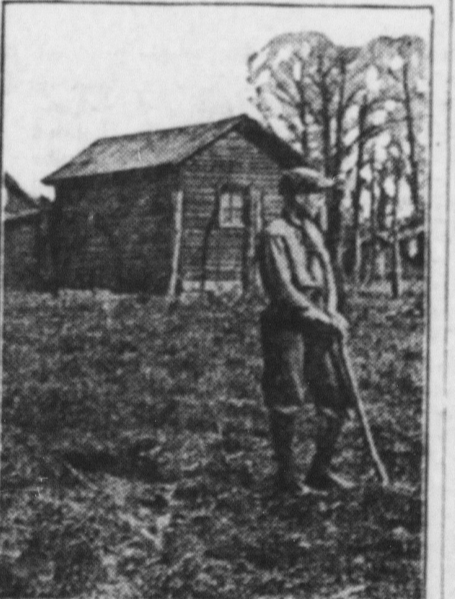
This Boy Began Gardening Operations at Right Time.

Chinamen invented everything before the Caucasians did, including backscratches.