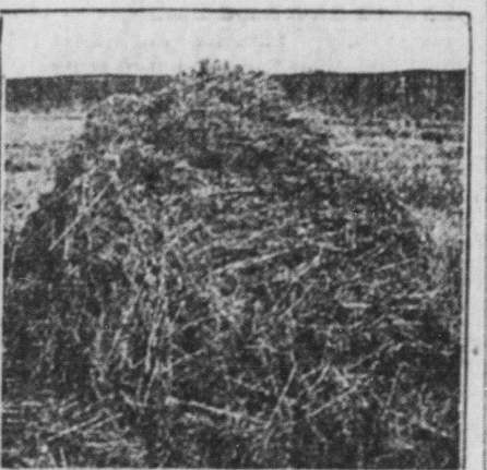
A Cock of Sweet Clover Hay Which Has Been Cured to Excellent Condition.

The attention of these smaller growers is called to the fact that buyers will desire to be sure that the seed offered them next winter is that of the annual and not that of the biennial