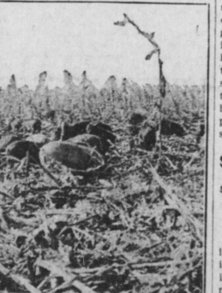
Hogging Down Corn Saves Labor Without Undue Waste.

A Good Five-Year Rotation. A system that is widely used calls for fencing the farm into five parts—six if you wish to retain a permanent pasture. Corn is planted in the first